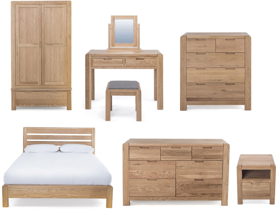
OSLO Bedroom Range